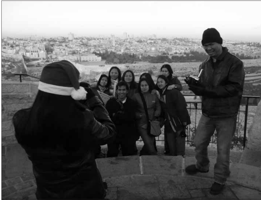
Mount of Olives, Jerusalem. Filipinos posing for the camera during a pilgrimage to the Mount of Olives, 30 December 2008.

Alleluia! [ in Tagalog: ] Do you want to see that? [ in English: ] You want that verse? Okay, we'll look for it very quickly [ in Tagalog ] because those verses are really exciting. [ In English ] Read Deuteronomy 16: 13–16, also Deuteronomy 31:10–13. It's specified there, “aliens, maidservants, menservants.” We're listed in the Bible! Alleluia! [ shouts: “Amen!”] Then maidservants, menservants, aliens who live in Jerusalem, Israel, the Holy City. — That's us! We were not even born yet [when] we were already written in...! Alleluia! 30