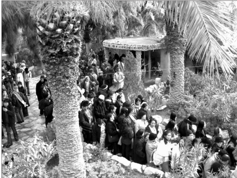
Christmas in Bethlehem. Asian pilgrims celebrate Christmas in Shepherd's Field adjacent to Bethlehem, 25 December 2004.

they were heavily, and negatively, prejudiced toward Palestinians or the “Arab World,” of whom they “knew nothing,” as she put it. Still, she preferred the neutral position of a listening learner to that of arguing with her employers.